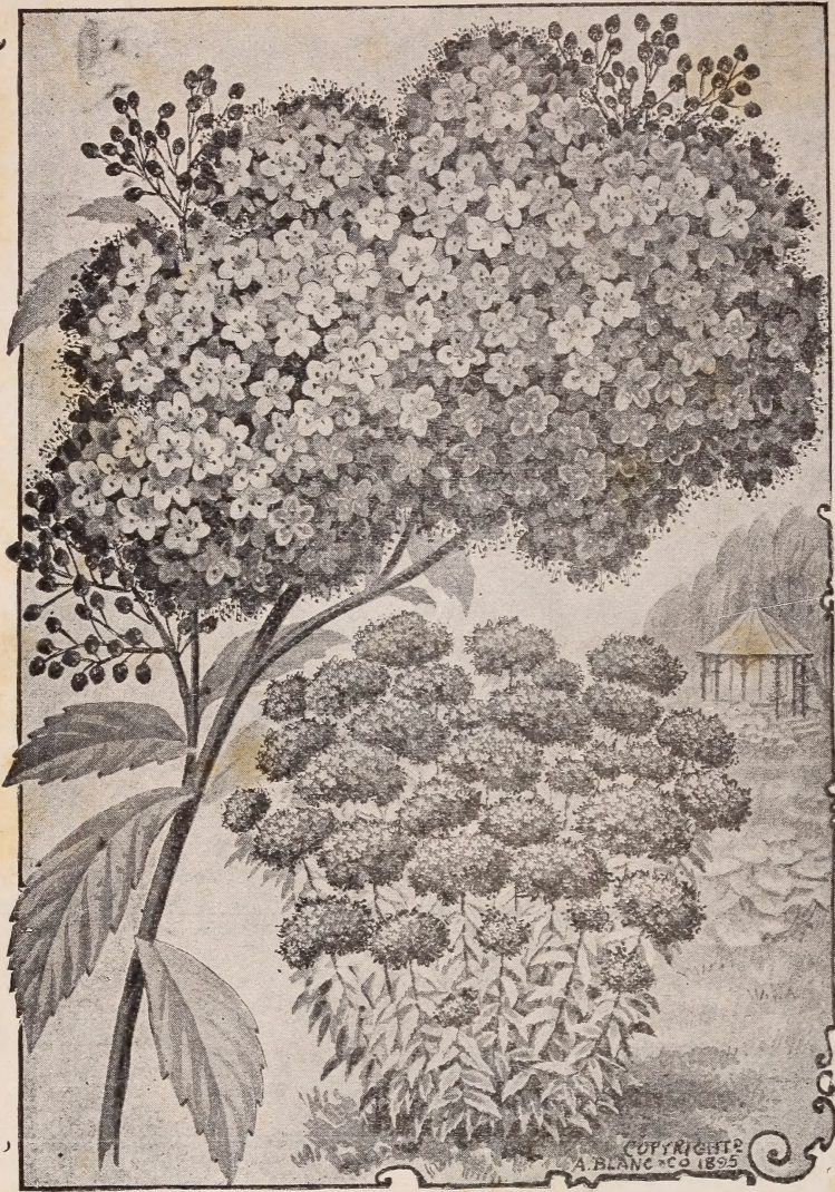
SPIREA ANTHONY WATERER.